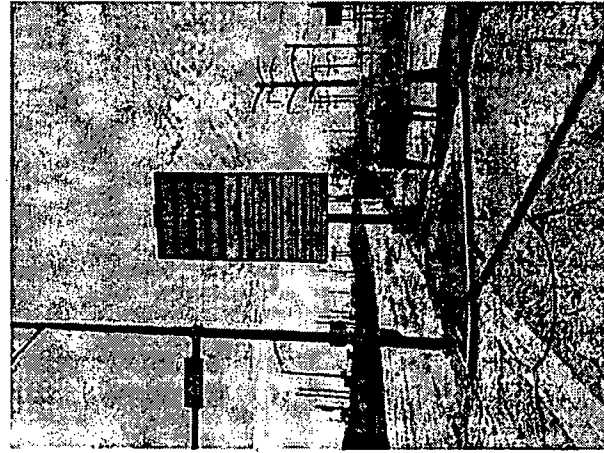
existing layout existing D/F pylon

N - POLE COVERS Material: Aluminum Color: Black