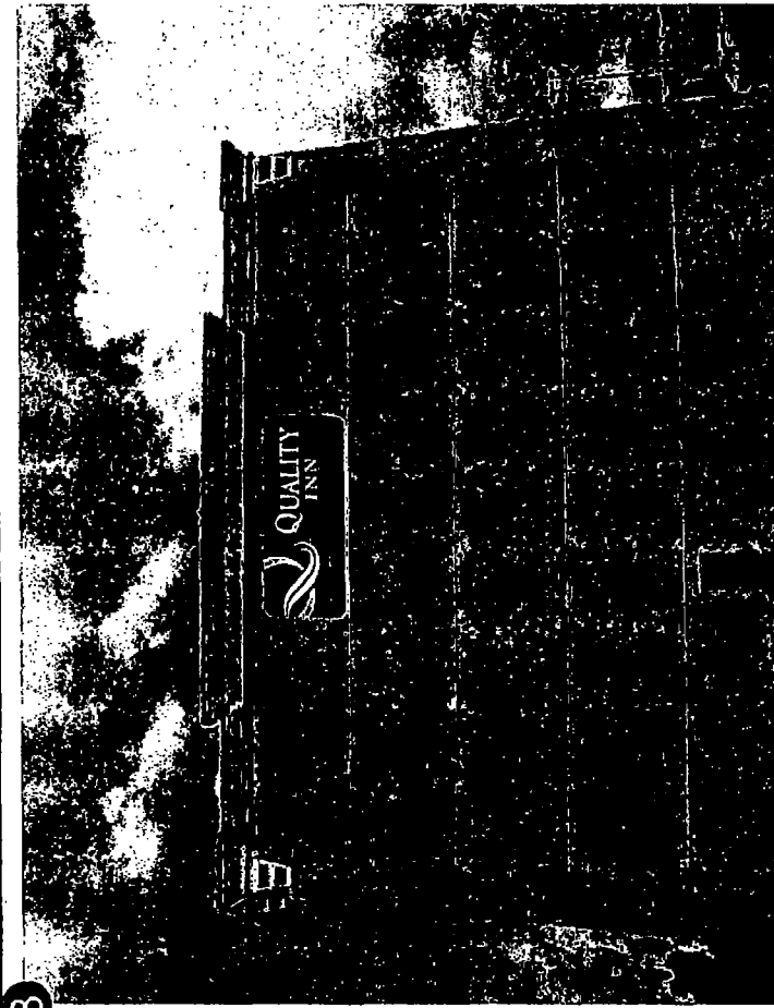
EXISTING: 6'-2" X 18'-0" WALL SIGN BOXED AREA: 111.00 SQ FT