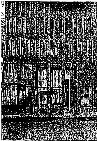
Existing Signage - (Long Front) Elevation