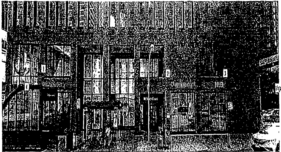
Proposed Signage - (Long Front) Elevation