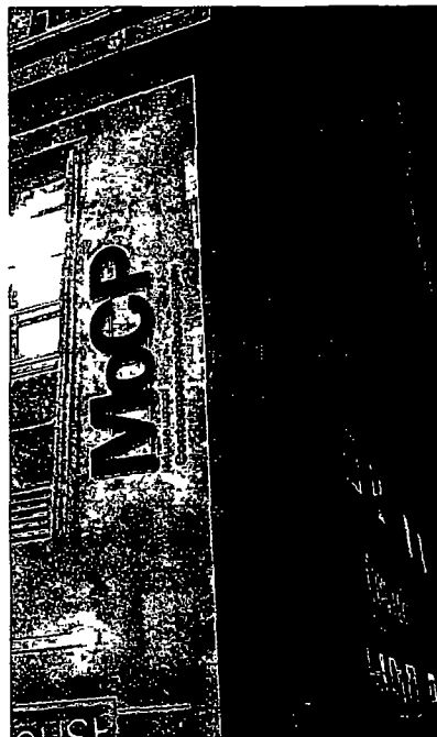
1/2" thick FCO acrylic

MoCP 2 reverse channel aluminum painted SATIN BLACK, mounted on 1 x 1 aluminum tube Remaining letters 1/2 FCO acrylic painted SATIN BLACK, mounted on 1 x 1 aluminum tube painted FMS 7535U to match building Mounting flush on wall masonry anchors located at mortar joints only